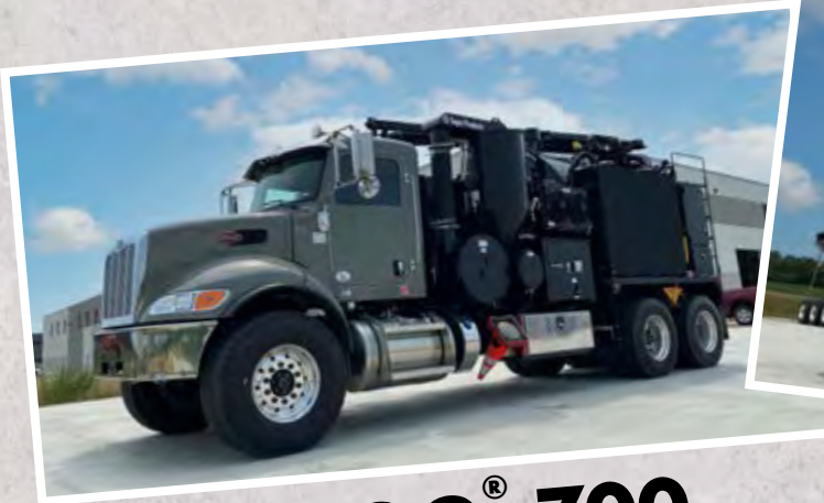
MUD DOG ® 700