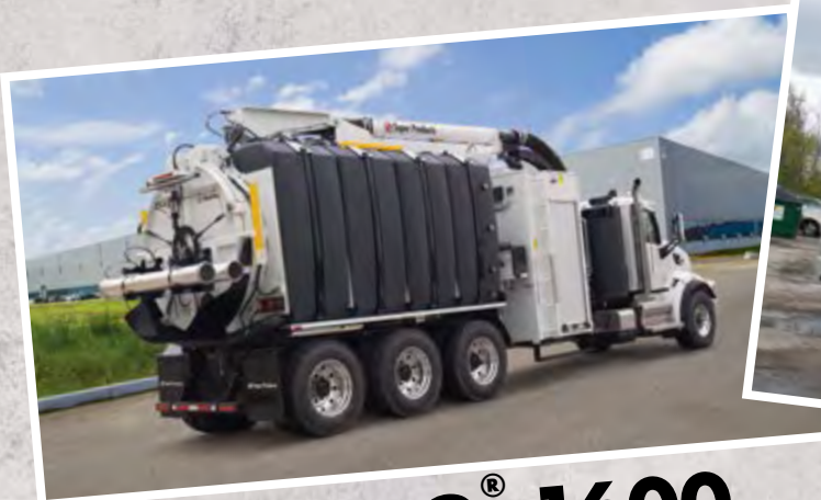
MUD DOG ® 1600