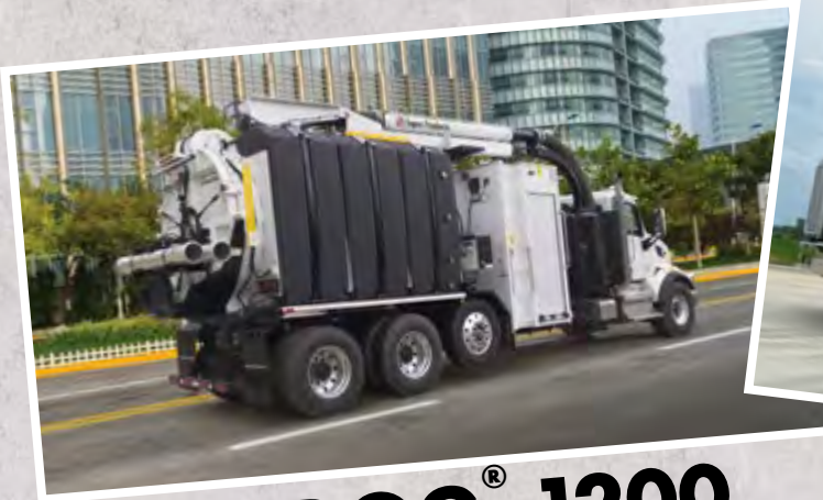
MUD DOG ® 1200