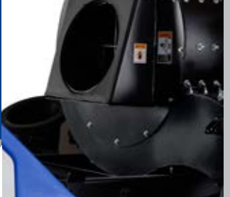
Whisper Wheel<sup>™</sup> Fan System