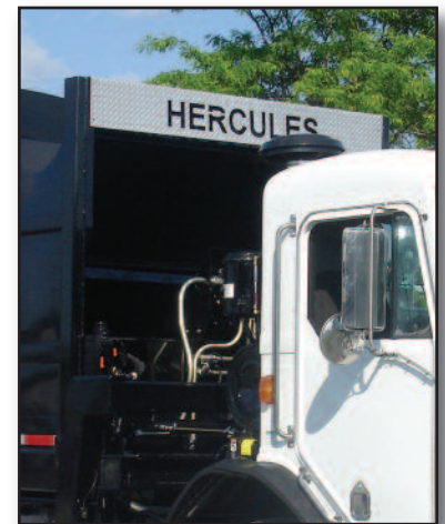
A Hercules at heart