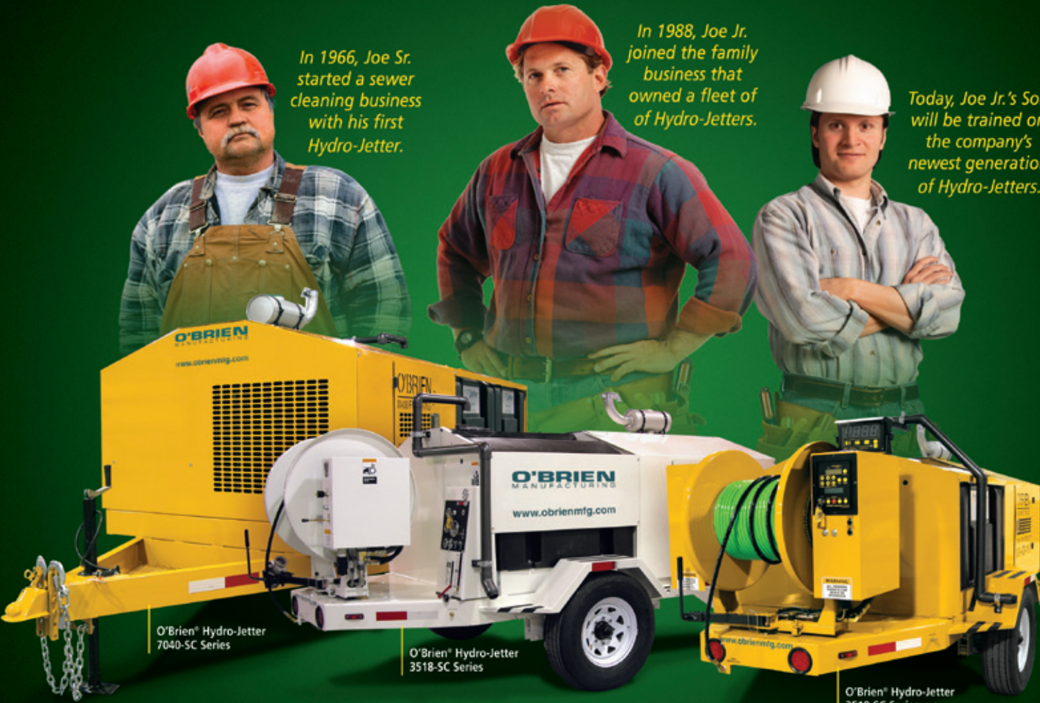
O'Brien® Hydro-Jetter 3518-SC Series