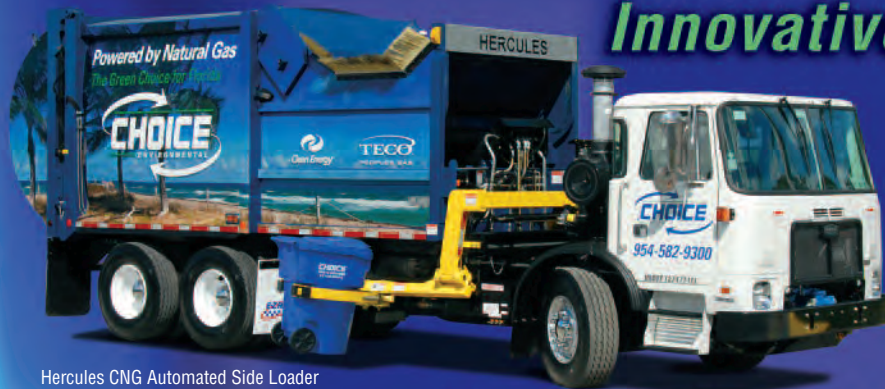
Hercules CNG Automated Side Loader