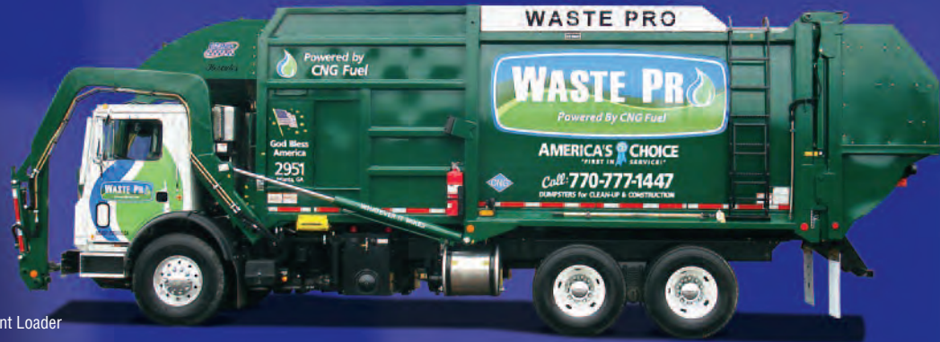
Hercules CNG Front Loader