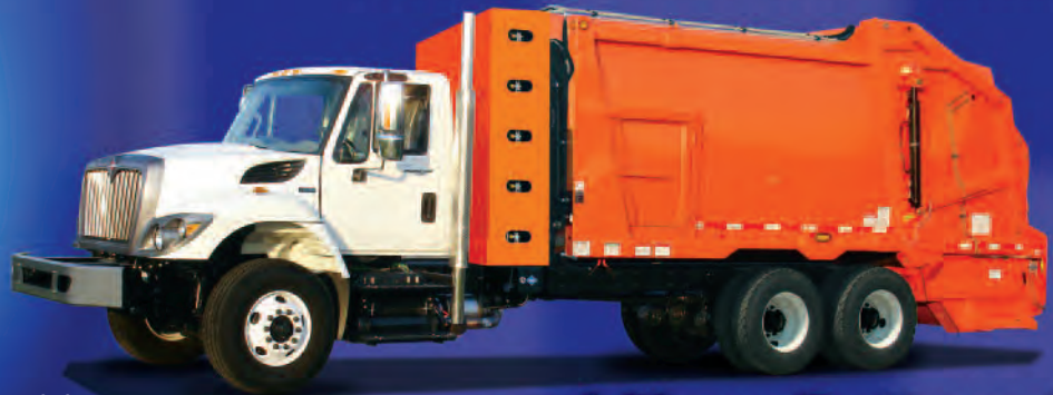
Goliath G400 CNG Rear Loader