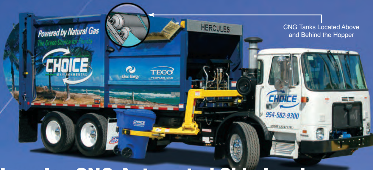
CNG Tanks Located Above and Behind the Hopper